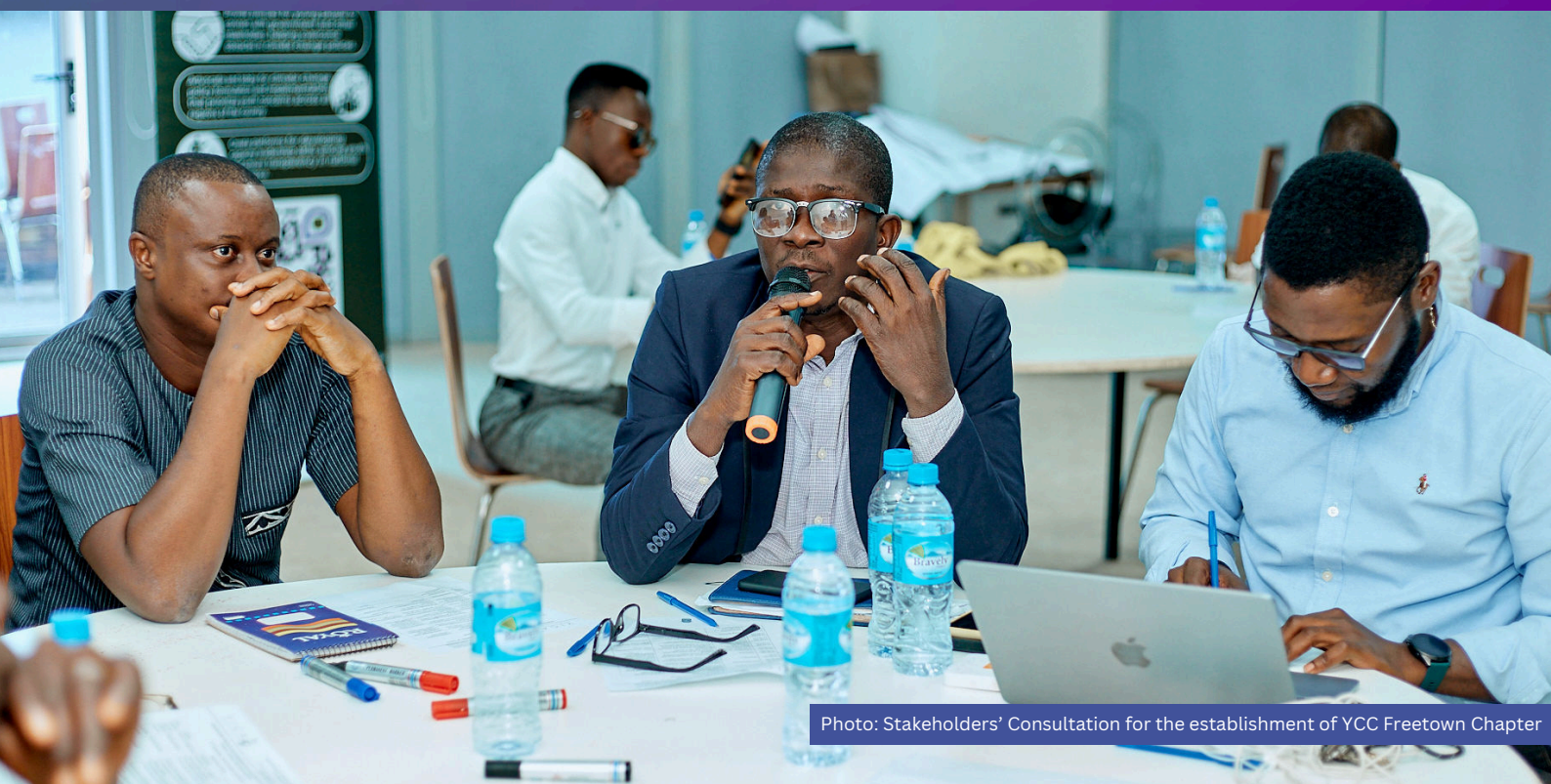
Photo: Stakeholders' Consultation for the establishment of YCC Freetown Chapter

7. Formed Valuable Partnerships: Collaborated with institutions like the Ministry of Environment and Climate Change, Sierra Leone Meteorological Agency, UNICEF, C40 Cities, Freetown City Council, UNICEF, Save the Children, and Bloomberg Philanthropies to drive impactful projects addressing urban climate challenges.