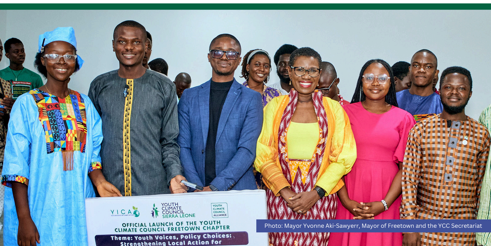
Photo: Mayor Yvonne Aki-Sawyers, Mayor of Freetown and the YCC Secretariat